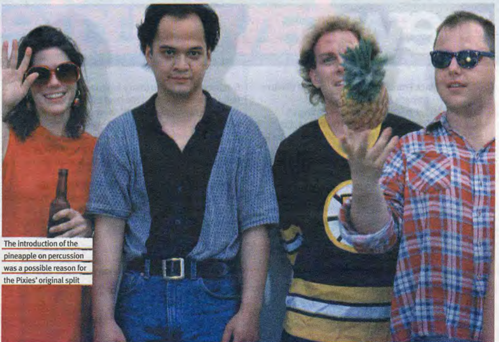
The introduction of the pineapple on percussion was a possible reason for the Pixies' original split

Didn't you fly on Concorde once? "Yeah, that was totally fantastic. We had talked about it for a couple of months and decided it was