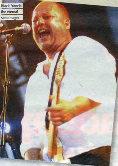
Black Francis: the eternal screamager

So no dredging up their acromonious split and how come, if Kim hates Francis and Francis hates Kim, they're so buddy-buddy. No mention of how zoned-out Kim appears. No quips about the magic act drummer Dave Lovering's been doing these past few years. And no dirty talk of dosh.